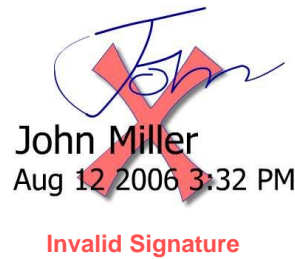
Figure 2: CoSign digital signatures (standard electronic signatures) seamlessly verify and retain proof of identity, intent, and document integrity without costly, complicated, or proprietary software.